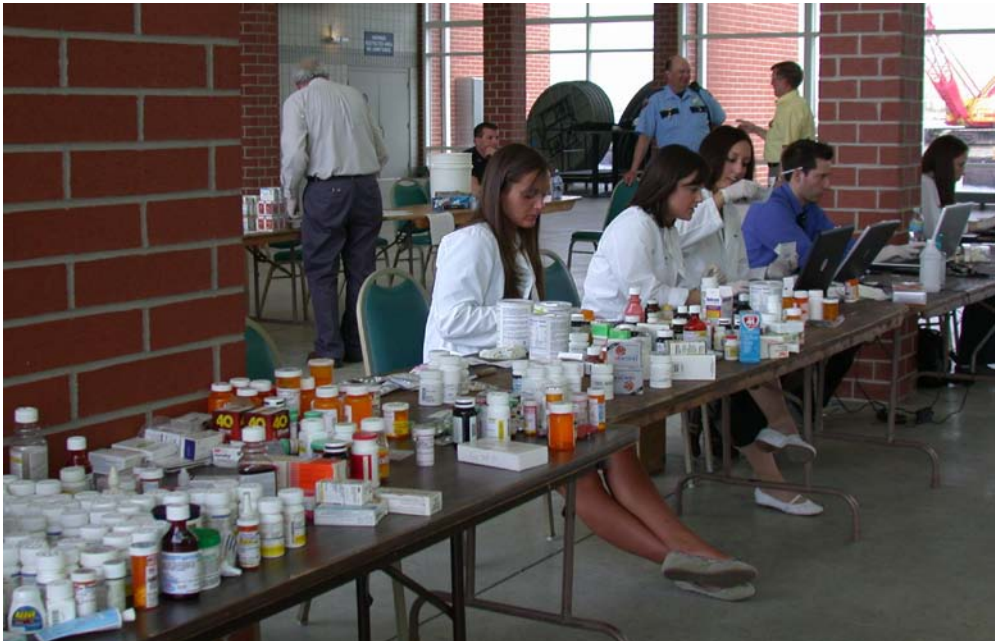
Pharmacists from the Lake Erie College of Medicine (LECOM) School of Pharmacy are midway into sorting through the over 600 pounds of medicines and personal care products that were collected (photo credit Sara Gris , Pennsylvania Sea Grant).