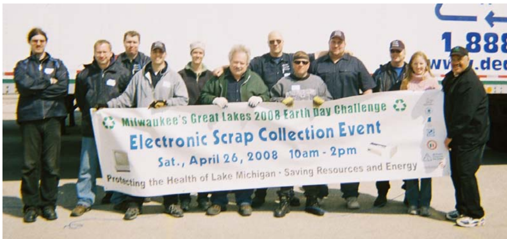
Organizers and volunteers from the City of Milwaukee Department of Public Works and Keep Greater Milwaukee Beautiful came together to take up the 2008 Earth Day Challenge (photo credit Rick Meyers, City of Milwaukee Dept. of Public Works).

The data includes amounts that have been reported since Earth Week (April 19 th - 27 th ) from various collection events in the Great Lakes Basin.*