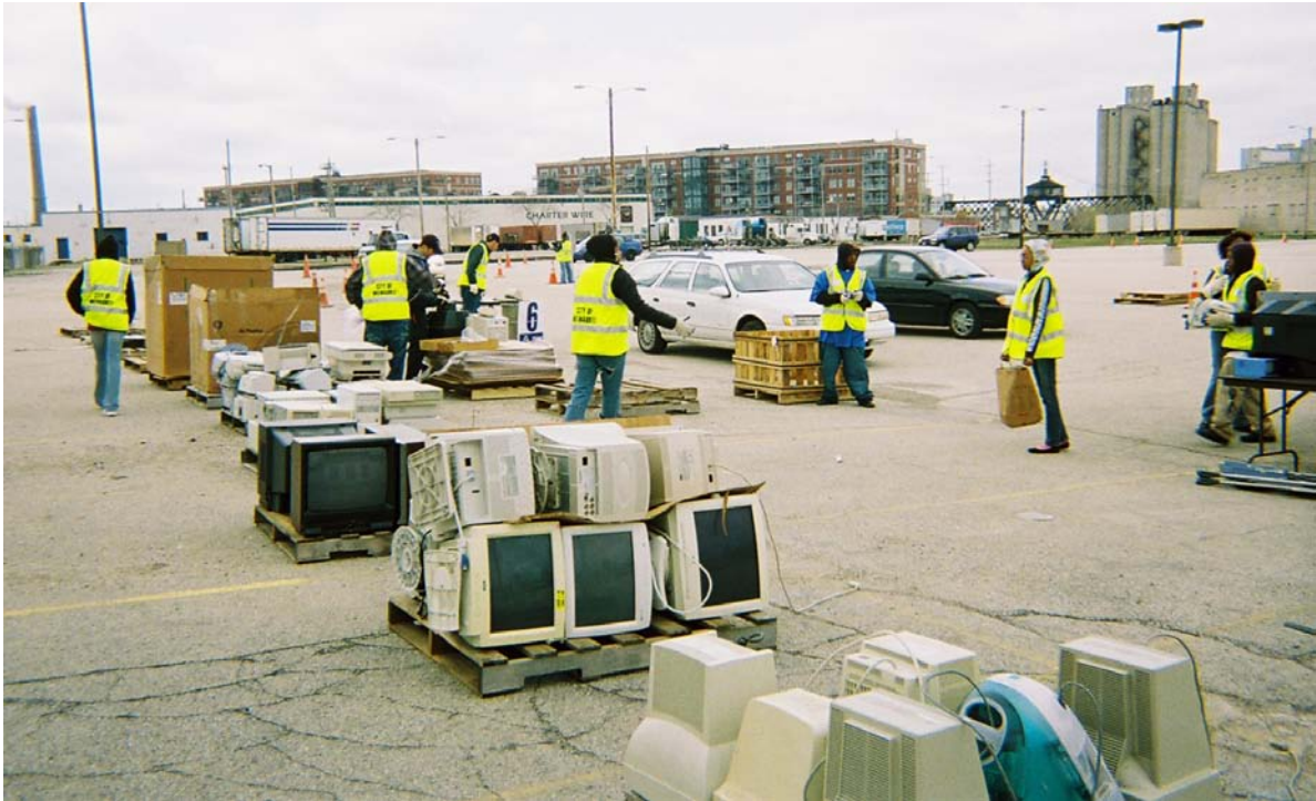
Forty-four volunteers from Keep Greater Milwaukee Beautiful helped man the collection event, during which 706 vehicles dropped off over 63,000 pounds of electronic waste (photo credit Rick Meyers, City of Milwaukee Dept. of Public Works).